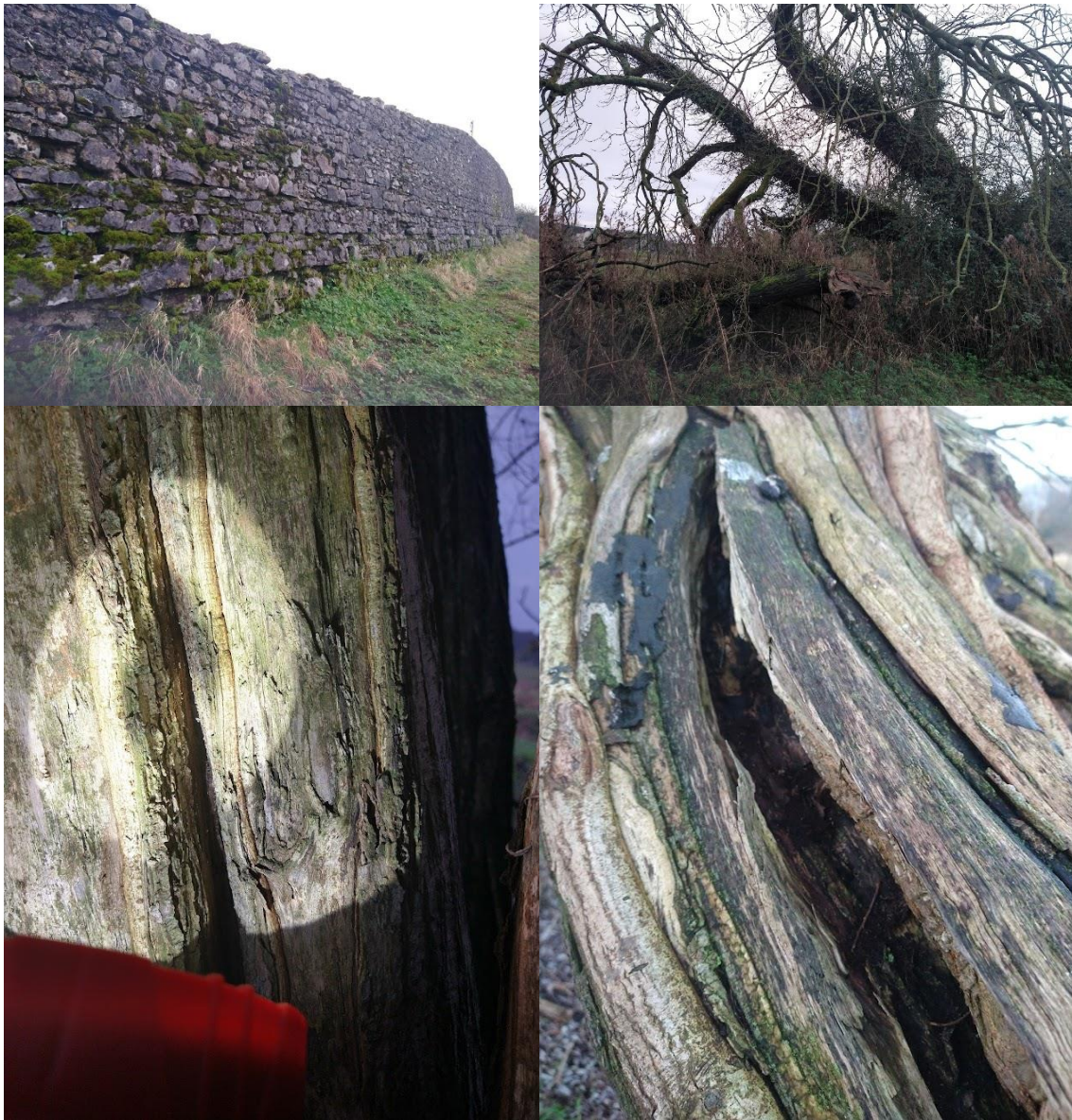
Wall and trees examined for bats

Appendices – Plates of site survey January 10 th 2022