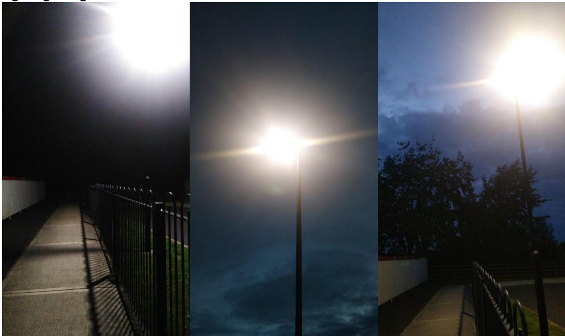
Lighting at Finlay Park