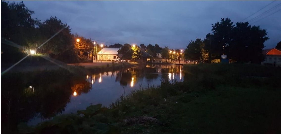
Lighting along the Grand Canal and within Naas close to the Canal