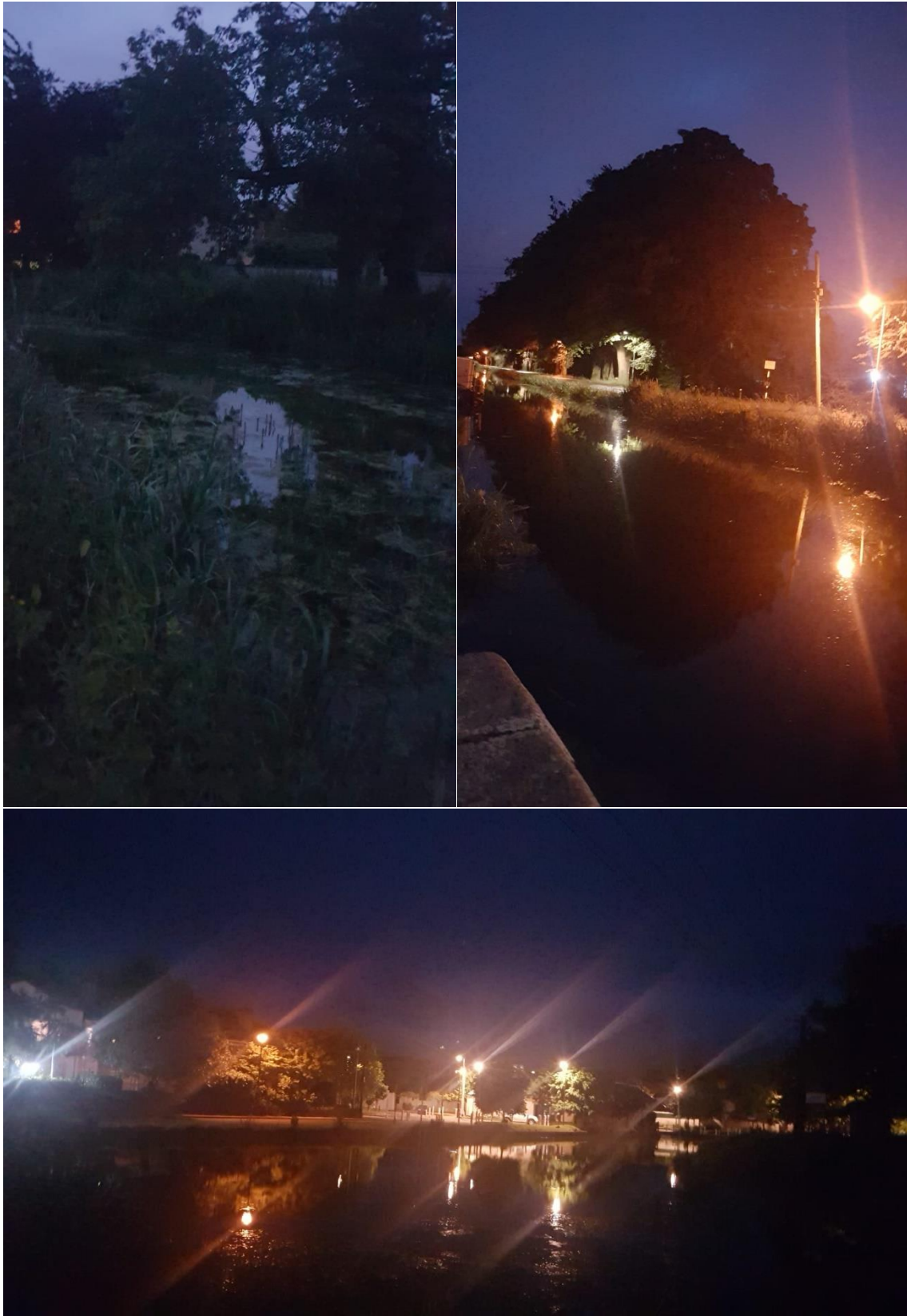
Area where most bat species were encountered (top left) and brightly lit areas around the perimeter of the site (all other images)