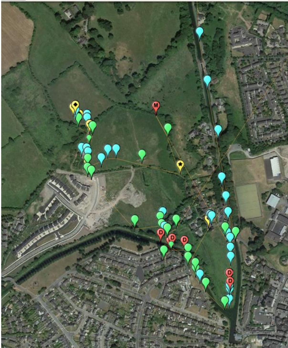
Bat activity within the site at Naas West June 24 th 2020