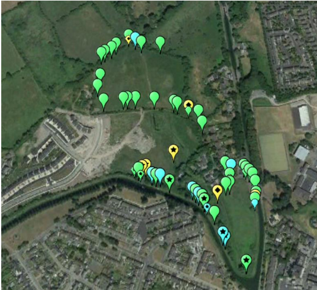
Bat activity within the site at Naas West August 2021