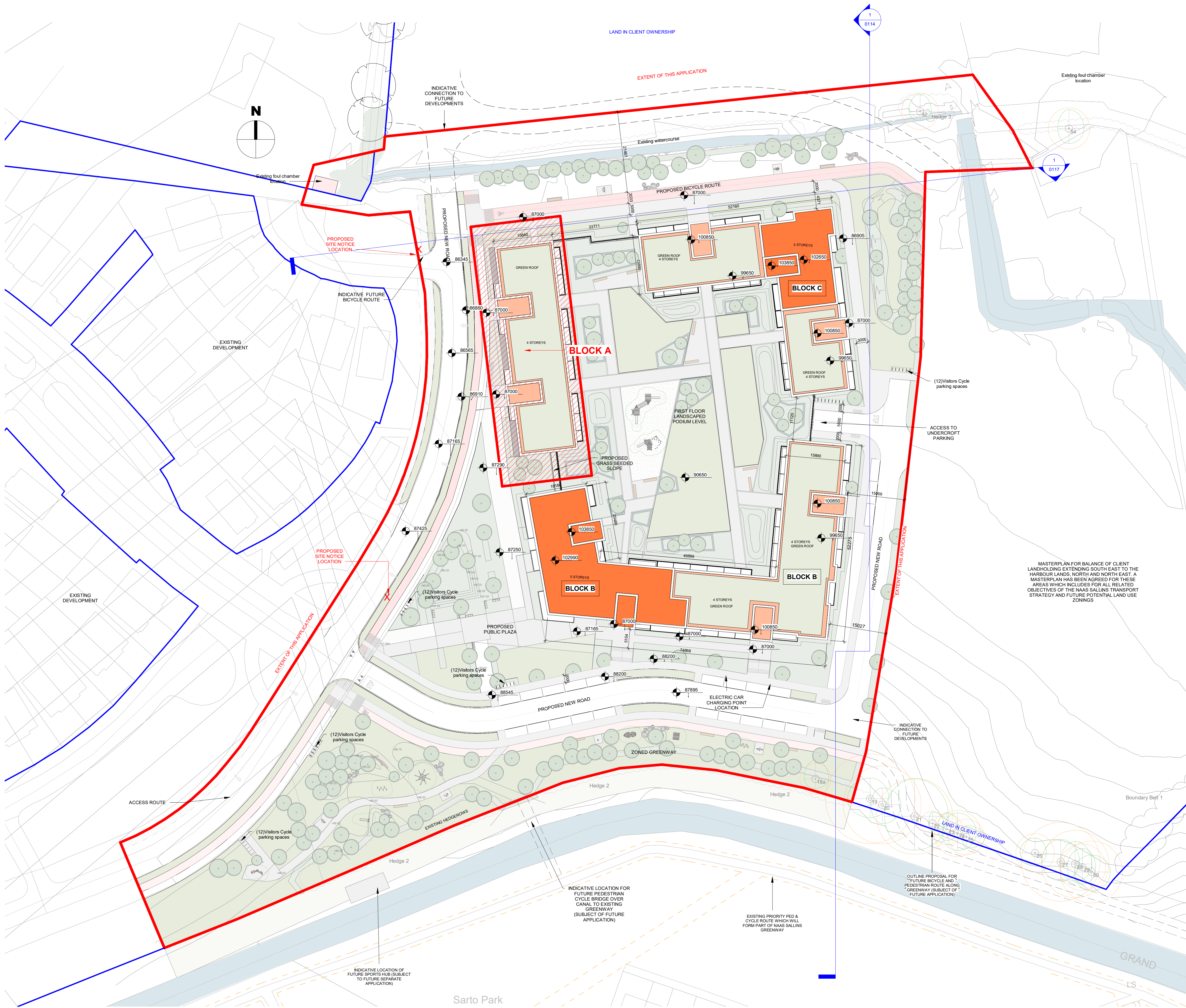
1 Proposed Site Layout - Zone 1 - Part V 1 : 500

Please consider the environment before printing this sheet