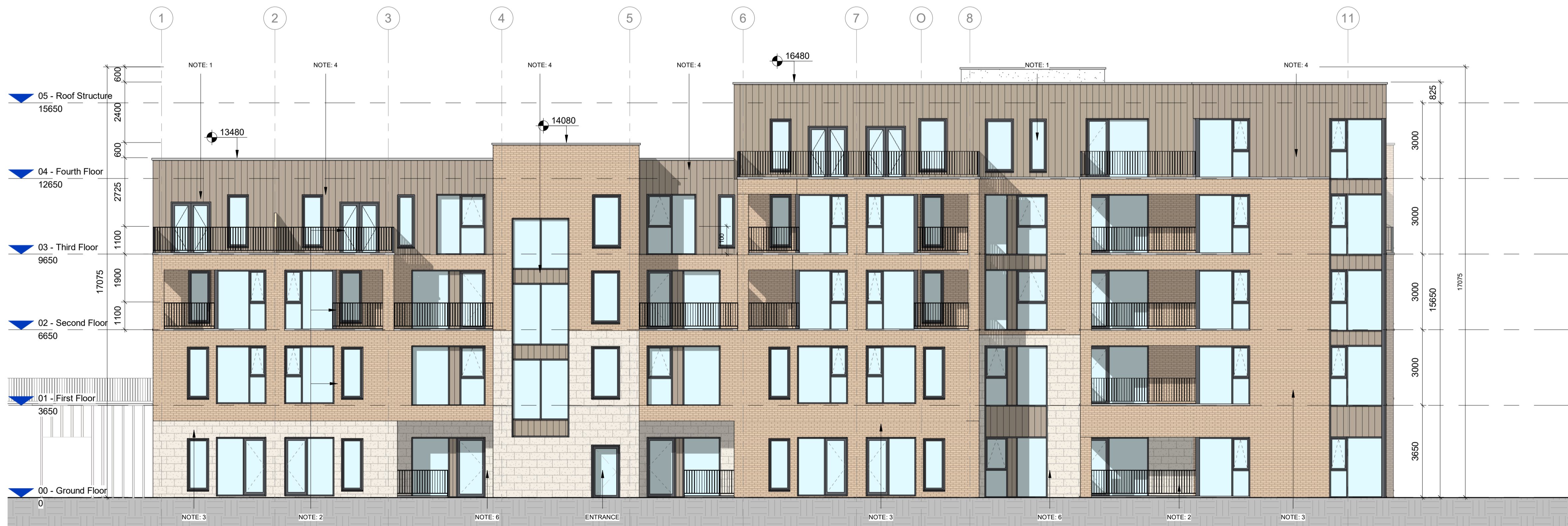
2 Elevation 2 1:100