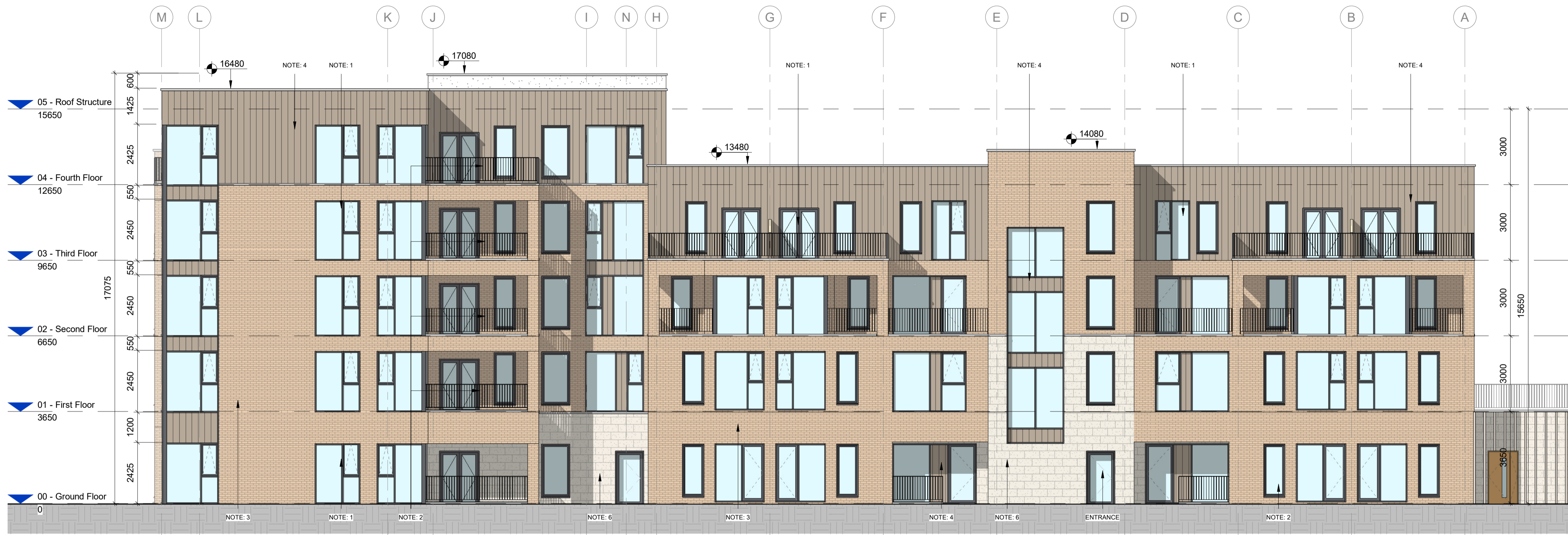
1 Elevation 1 1:100