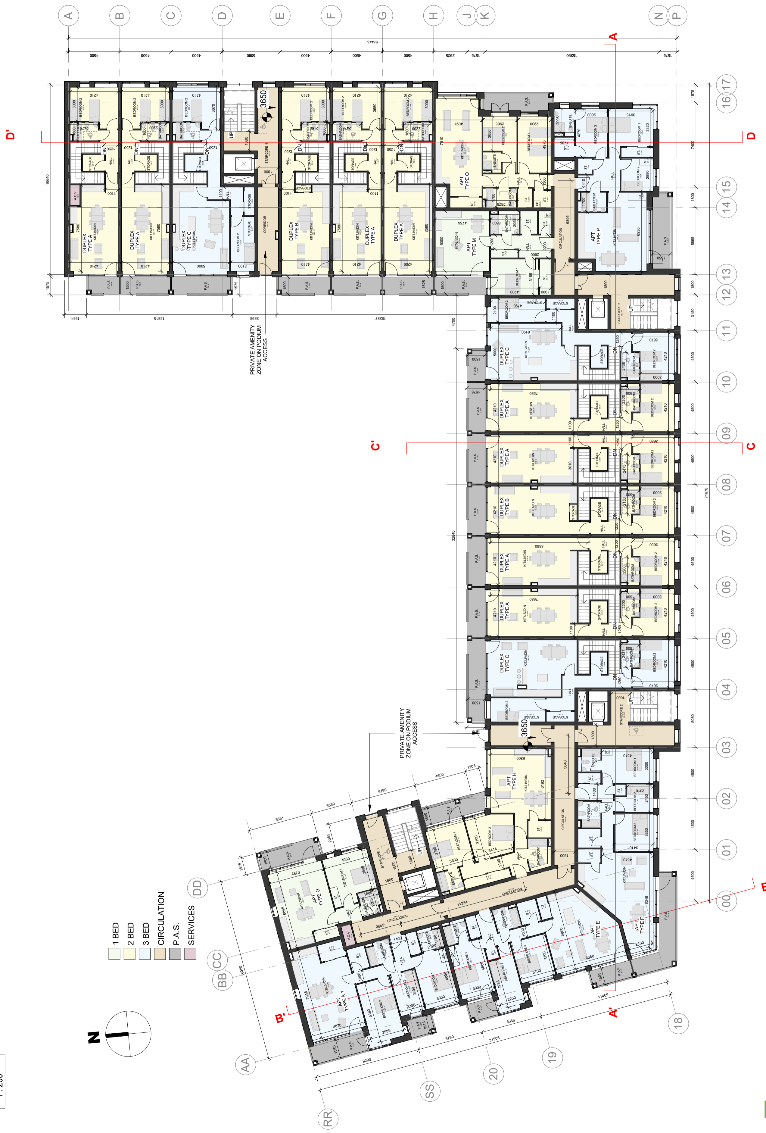
2 01 - First Floor 1:200