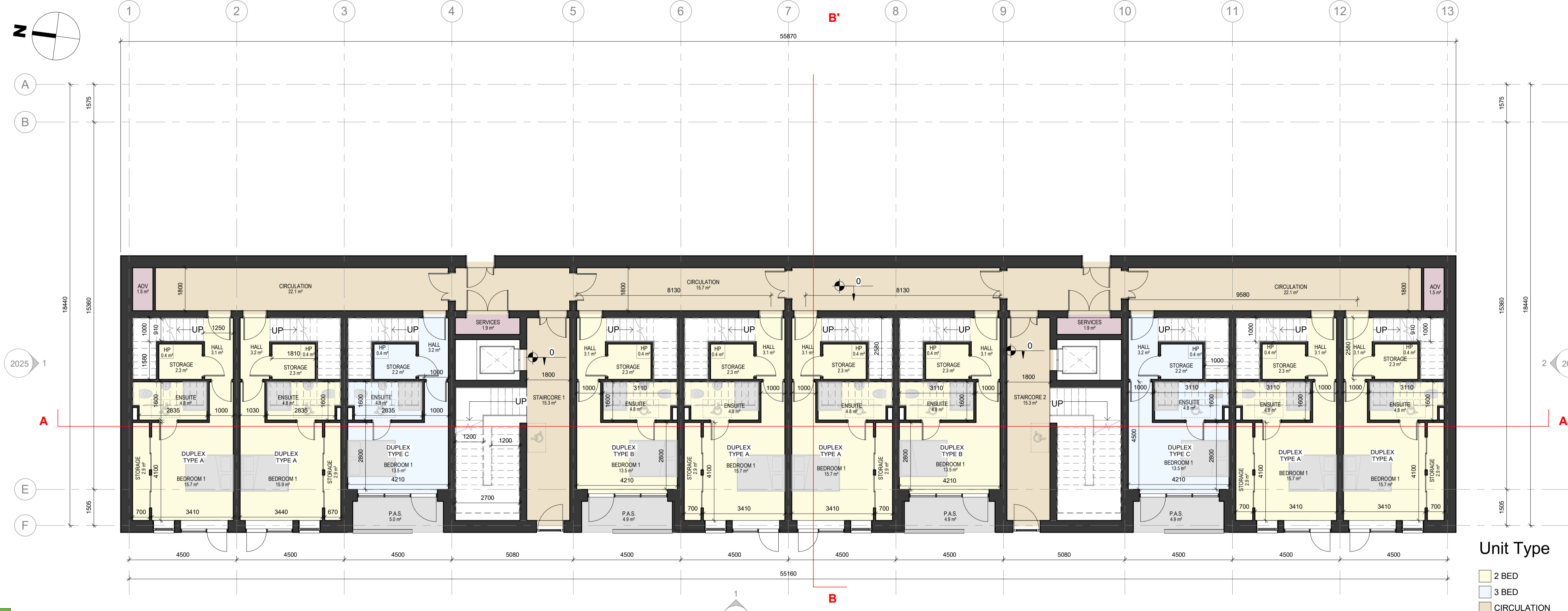
1 Ground Floor 1:100